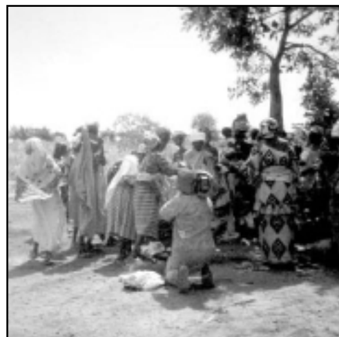
Mothers lead their daughters into the bush for cutting.

Currently there are two bills in Washington which can help Mali and other countries end poverty and improve healthcare. The Global Poverty Act (H.R. 1302) would direct the President and USAID to create and implement a comprehensive strategy to reduce poverty worldwide. Specifically, it would ensure that U.S. foreign policy